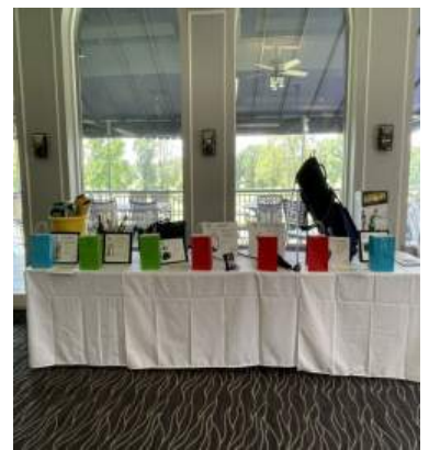
Pictured here are some of the great Raffle Ticket prizes