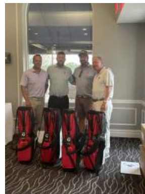
Second place winners