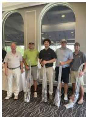
First place winners