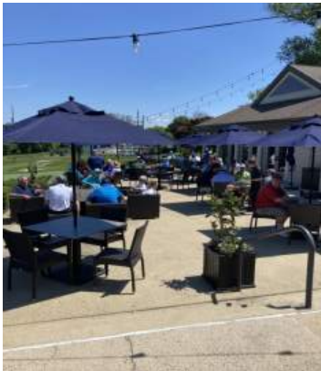
A delicious barbecue lunch before the start of the Tournament; snacks & drinks on the Course. Then a great buffet dinner afterwards.