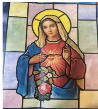
SACRED HEART OF MARY