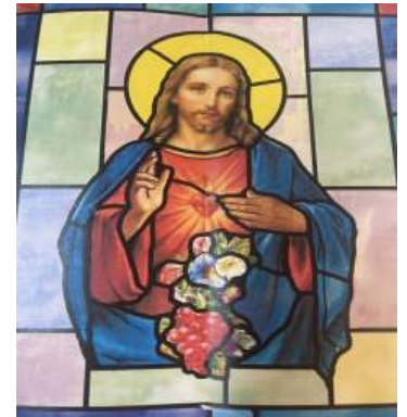
SACRED HEART OF JESUS