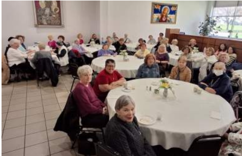
Pilgrimage to the National Shrine of Our Lady of Czestochowa