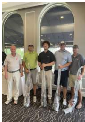
First place winners