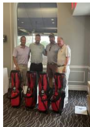
Second place winners