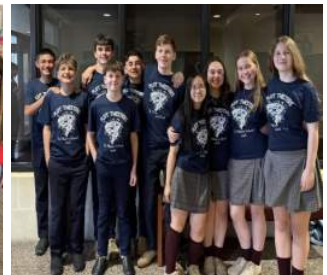
Some members of the SHS Reading Olympics Team