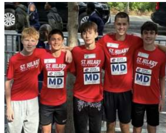
SHS Senior Boys Relay Team at the Penn Relays - came in 6th place in the 4 x 100 division

THANK YOU to the committee members, sponsors, runners, and families for their support of the Lion Pride Run recently. Congrats to all the participants!