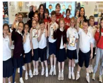
Some of the SHS Literacy Club members