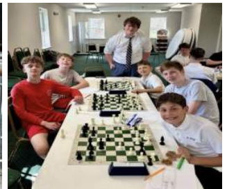
Some members of the SHS Chess Club