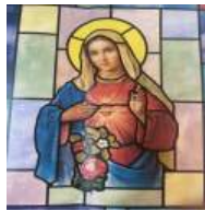
Sacred Heart of Mary Hall to Church Door