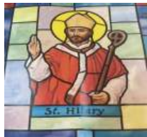
St. Hilary School Hall Door