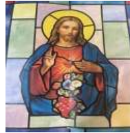
Sacred Heart of Jesus Church to Courtyard Door