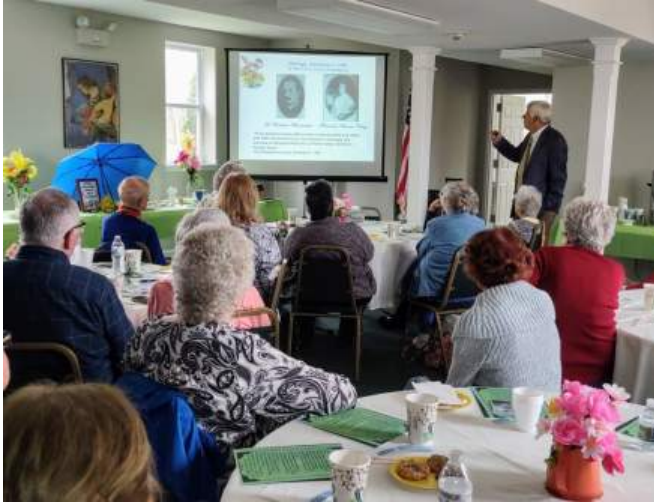
55+ Spirit Club pictured here at their April Meeting