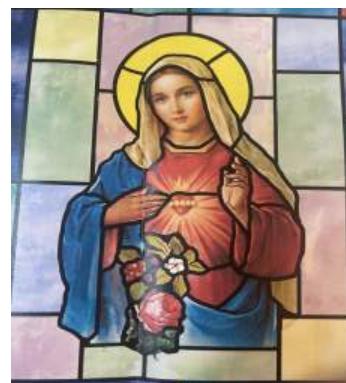
SACRED HEART OF MARY